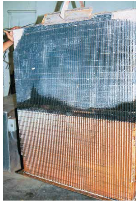
This photo shows a "before (top half) and after" of our Ultrasonic cleaning process.

For customers who need their radiator picked up at their jobsite, Yancey Bros. Co. offers convenient pick-up and delivery service. We can also easily transport your radiator from any of our Georgia stores to one of our radiator shops using our overnight parts delivery system.